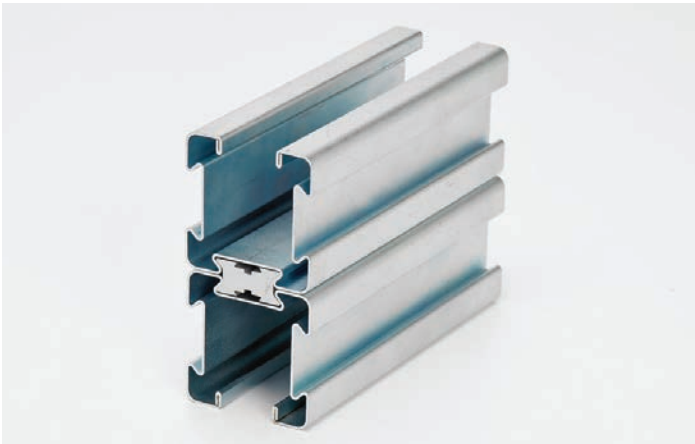
4Dimension strut with dove tail bar shows back-to-back solution.