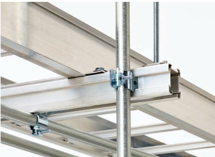
4Dimension strut with cable tray and universal pipe clamps.